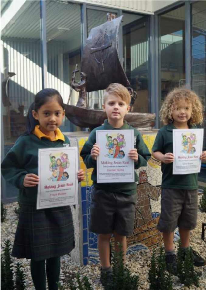
Award Winners left to Right: