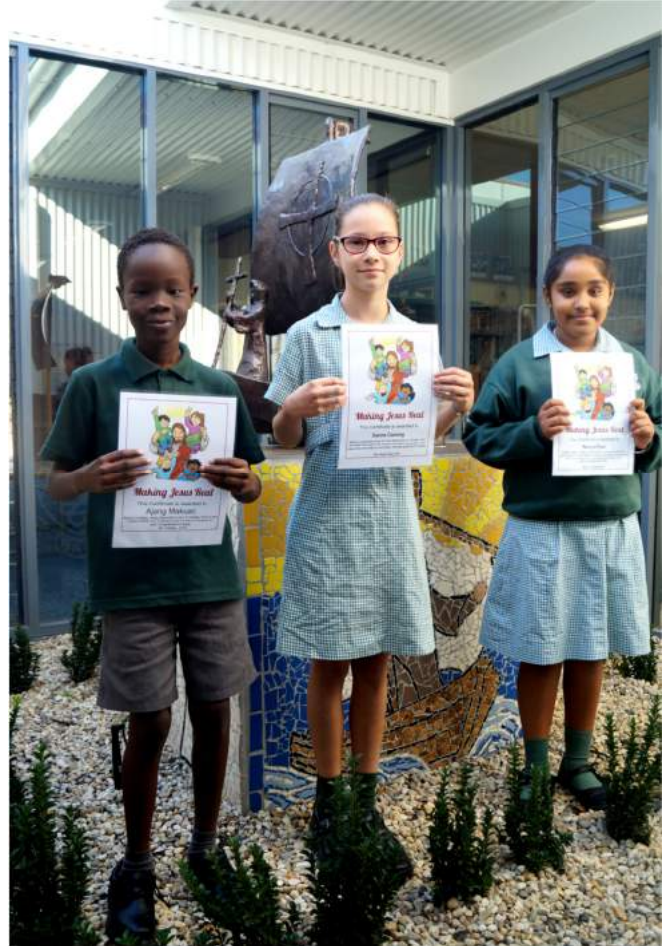
Award Winners Left to Right: